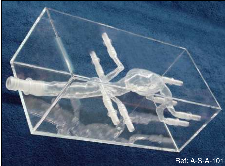
Abdominal aorta aneurysm model.